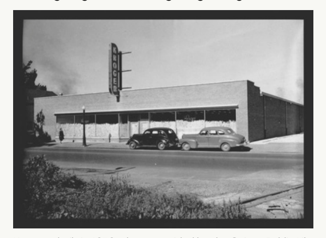
Krogers, built in 1950, photo provided by the Quincy Public Library

"We knew from our own internal data and community data, the location for our new home would be critical if we wanted to reach the people with the greatest need. We found a vacant property for sale at 224 S. 8th Street. It had most recently been a carpet store, but the cool thing is, it was originally built as a Kroger's grocery store.