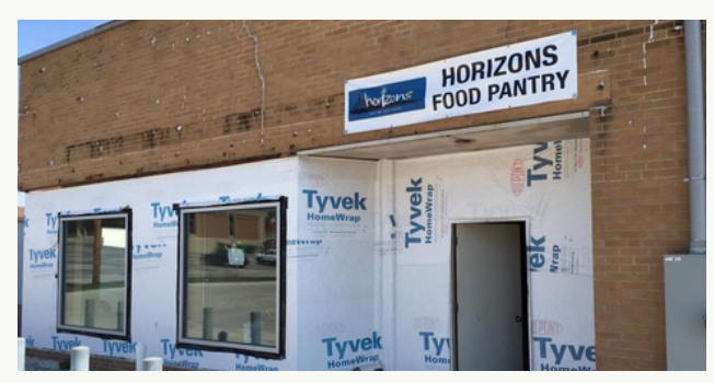
Renovations of the new Horizons location

"Space limitations at St. John's and the growing need in our food pantry forced our decision to open the food pantry without completing the rest of the project. We had the funds to complete the renovations, but we didn't have enough money to install the bathrooms in the new space. The board took a vote and decided to move ahead with the work, knowing that could mean borrowing money.